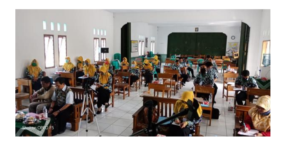
Figure 5. Training Atmosphere in Community Service Activities